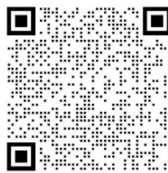
SSBA 2023 路演